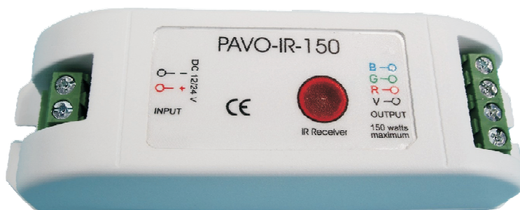
12V/24V, 150W, RGB Controller activated with the TRISTAR-IR-1627 Remote Controller